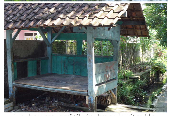
bench to rest. roof-tile in clay makes it colder