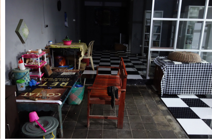
the low table to cook on