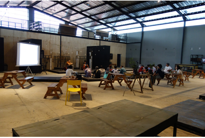
the main building